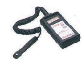
1749 Radiometer RM400