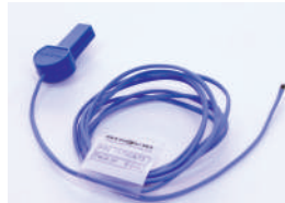
11730A73 Blue Skin Probes (6pcs)