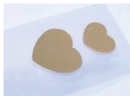
565 - 11814A73 Sensor probe fixer Gel Reflect Ø26 & Ø38 (24pcs)