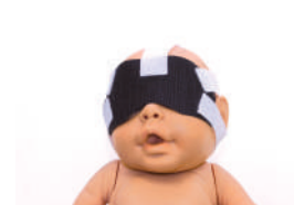
12423A70 Phototherapy Mask (50pcs)