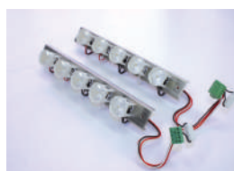
12172A73 Optical Unit - Phototherapy and Illumination Leds (2pcs)