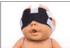
1645 Eye Mask (Pack of 50 pcs)