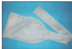
13010A20 Pad cover (Sterile, Order multiple: 10 pcs)