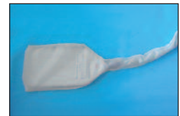
7291A72 Pad with Cover (1 pc)