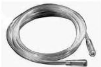
12873A73 Gas Supply Tube 6/box